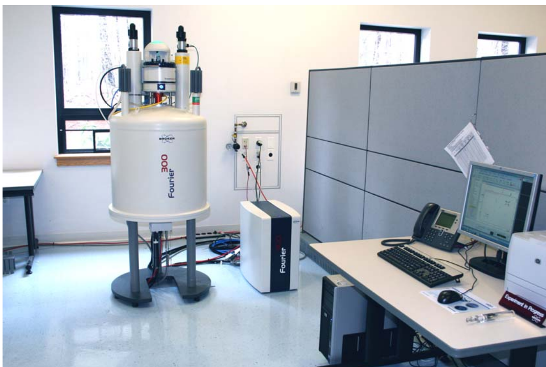
Figure 4.1: Room layout example of an installed Fourier system

The Fourier system can be placed in to a small room area but certain requirements have to be met. There should be a clear path, free of obstacles, to bring in containers to service the magnet with liquid Nitrogen and Helium. The console can be placed close to the magnet but it is recommended that the work station should be placed a minimum distance away from the magnet. As a room layout example, the Fourier system with the optional SampleXpress Lite is shown in Figure 4.1 below.